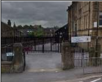
Black gate on Blacker Road

Arrive black gate, pick up through rainbow gate.(see below)