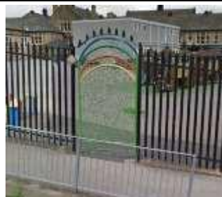
Rainbow gate on Clement Street