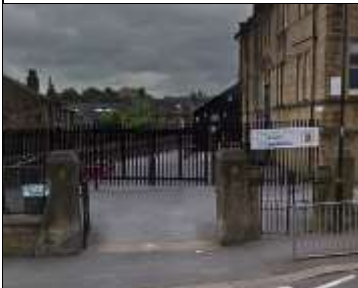
Black gate on Blacker Road

Arrive black gate, pick up through rainbow gate.(see below)