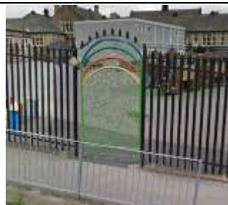
Rainbow gate on Clement Street