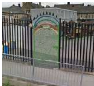
Rainbow gate on Clement Street